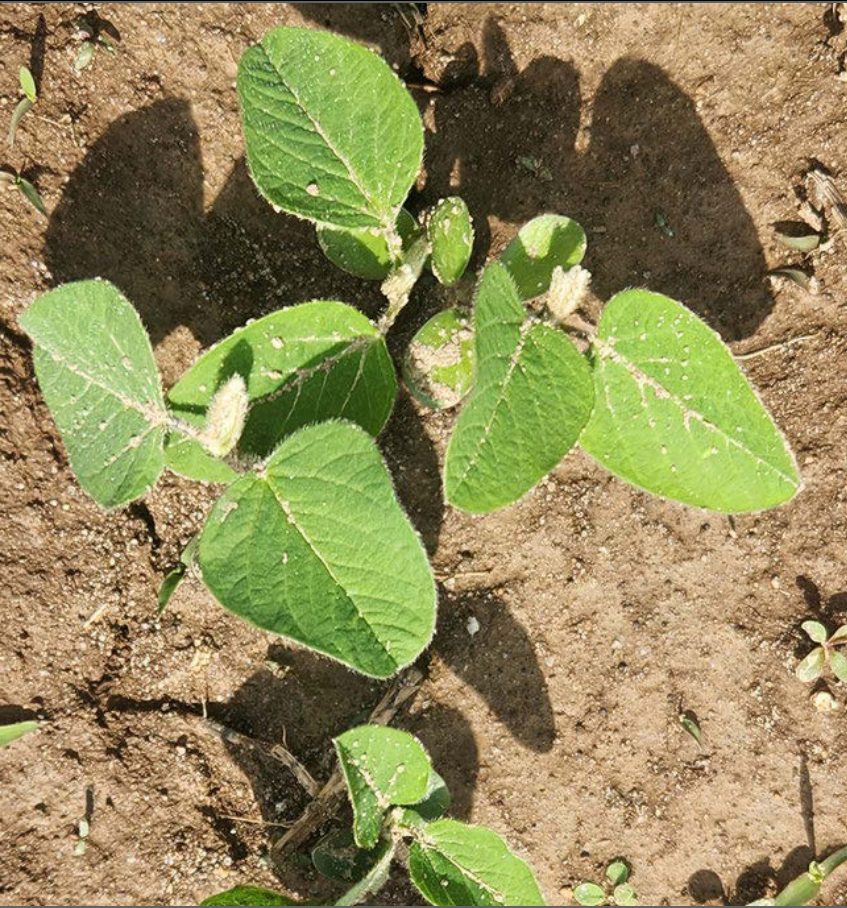
Untreated Check – 0%